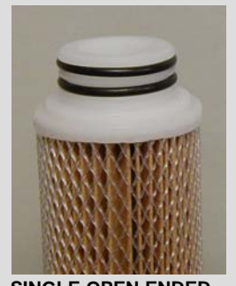
SINGLE OPEN ENDED W/ 222 or 226 O-RING BASE