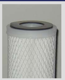
DOUBLE OPEN ENDED W/ GASKETS